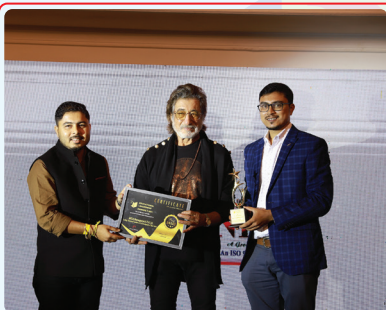
NRDS received Education Leadership Award from Actor Shakti Kapoor in 2021 for leading Institutional Institute for the Development of Rural Areas at Mumbai.