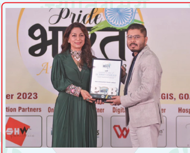
NRDS Group received Pride of Bharat Award in "the best vocational training institute in Assam" category from the noble hands of renowned Bollywood Actress, Juhi Chawla ji.