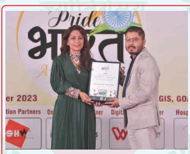
NRDS Group received Pride of Bharat Award in "the best vocational training institute in Assam" category from the noble hands of renowned Bollywood Actress, Juhi Chawla ji.