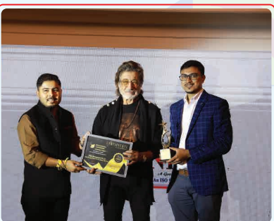
NRDS received Education Leadership Award from Actor Shakti Kapoor in 2021 for leading Institutional Institute for the Development of Rural Areas at Mumbai.