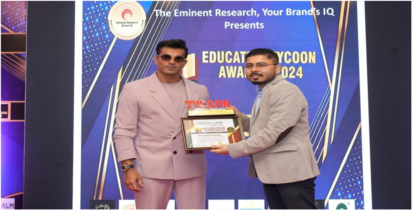
NRDS Group has received the "Most Prominent Educational Institution in North-East India" award from the hands of sensational Bollywood actor Mr. Karan Singh Grover at the Businesses Tycoon Awards, 2024 held at Mumbai.