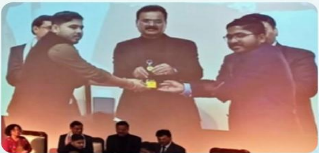
NRDS Received two awards, 5th Best Training Partner and 3rd Best Training Partner Placement from Assam Skill Development Mission in 2021. The award was handed to