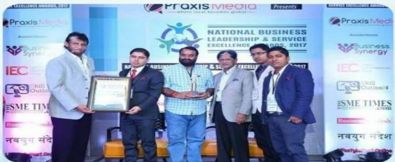
Best Vocational Training Institute in Assam at National Business Leadership & Service Excellence Award 2017