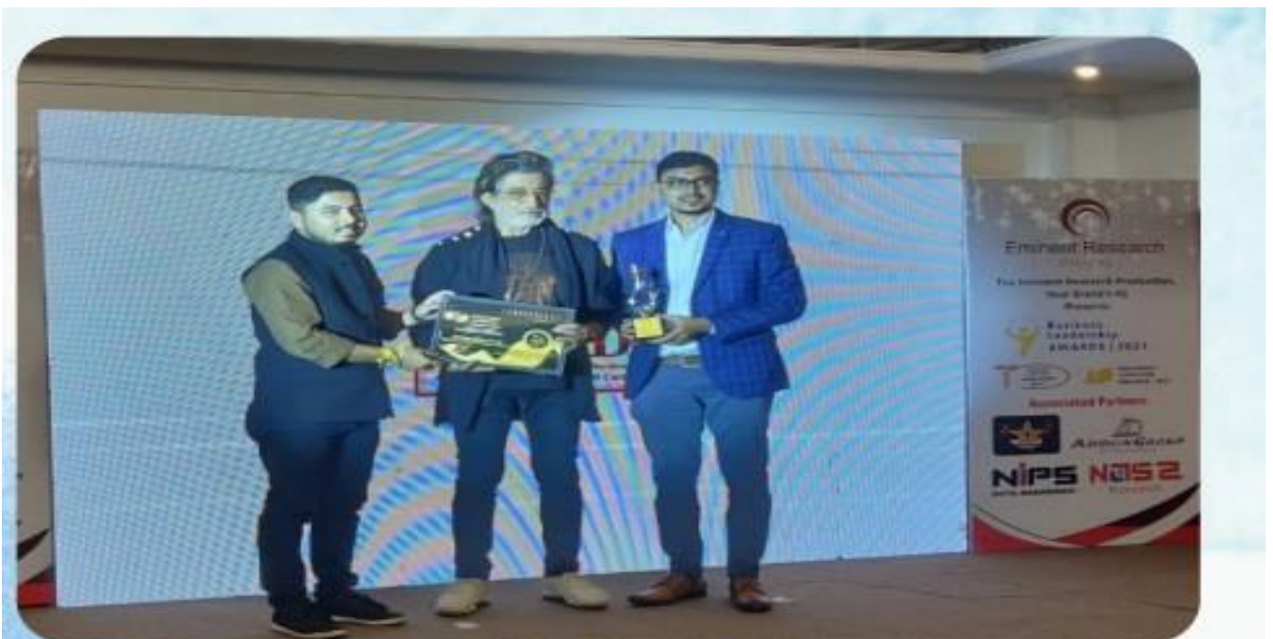
NRDS Received Education Leadership Award from Actor Shakti Kapoor in 2021 for Leading Educational Institute for the Development of Rural Areas.