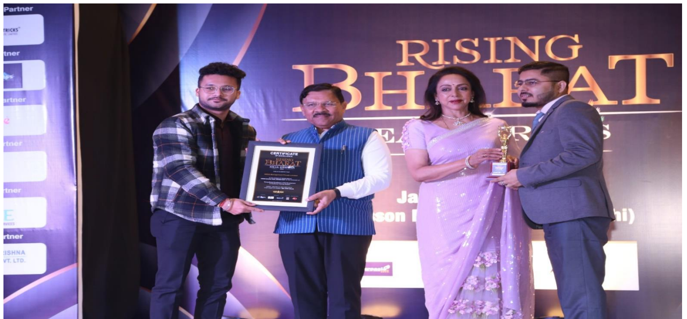
NRDS Group has received Rising Bharat Award 2024 from the auspicious hands of Smt. Hema Malini ji, sensational Dream Girl of Bollywood Cinema & Hon'ble Member of Parliament, BJP and Hon'ble Ex-National Vice President of BJP, Shri Shyam Jaju ji, in the category Rising Bharat Excellence in Skill Development & Vocational Training (Assam).