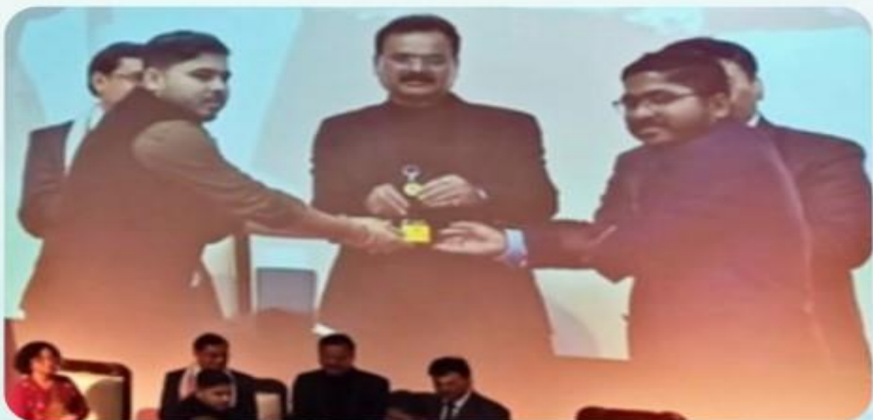
NRDS Received two awards, 5th Best Training Partner and 3rd Best Training Partner Placement from Assam Skill Development Mission in 2021. The award was handed to the Directors by the honourable Skill Minister of Assam Mr.