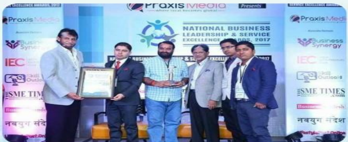
Best Vocational Training Institute in Assam at National Business Leadership & Service Excellence Award 2017