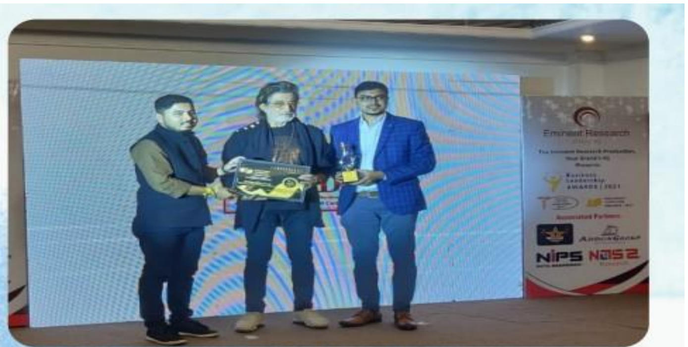
NRDS Received Education Leadership Award from Actor Shakti Kapoor in 2021 for Leading Educational Institute for the Development of Rural Areas.