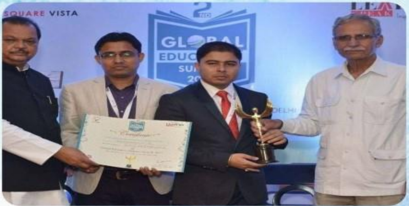
Excellence in Rural Skill Development in Assam at Global Education Summit Award 2017