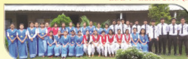
B.A. 5 th Batch, 2020