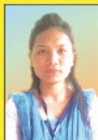
Miss Bijeli Bora All Assam (Boys) (Vill.) Topper, 2020