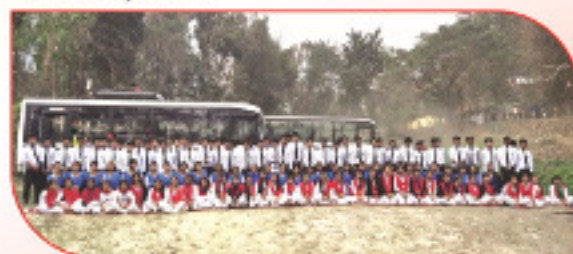
H.S. 7 th Batch, 2020