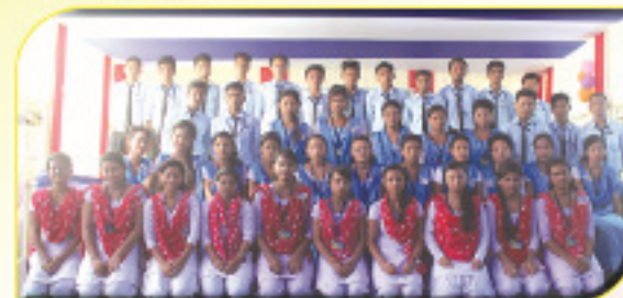
H.S. 2 nd Batch, 2015