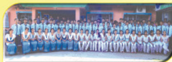
H.S. 1 st Batch, 2014