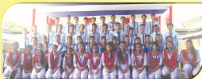
B.A. 1 st Batch, 2016 (1 st Successor)