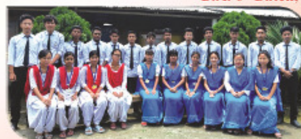
B.A. 7 th Batch, 2022