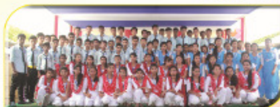
H.S. 3 rd Batch, 2016