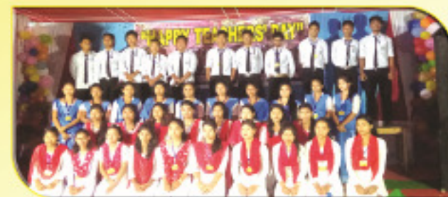
B.A. 4 th Batch 2019 (Successor)