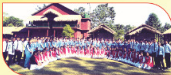
H.S. 5 th Batch, 2018