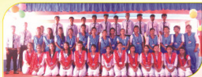
B.A. 2 nd Batch, 2017 (2 nd Successor)