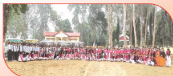
H.S. 8 th Batch, 2021