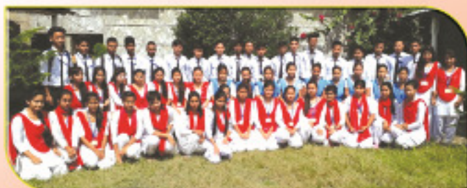
B.A. 3 rd Batch, 2018 (3 rd Successor)