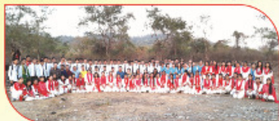
H.S. 6 th Batch, 2019