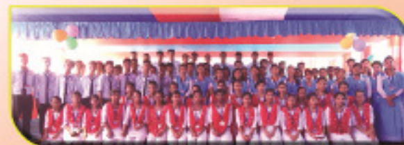
H.S. 4 th Batch, 2017