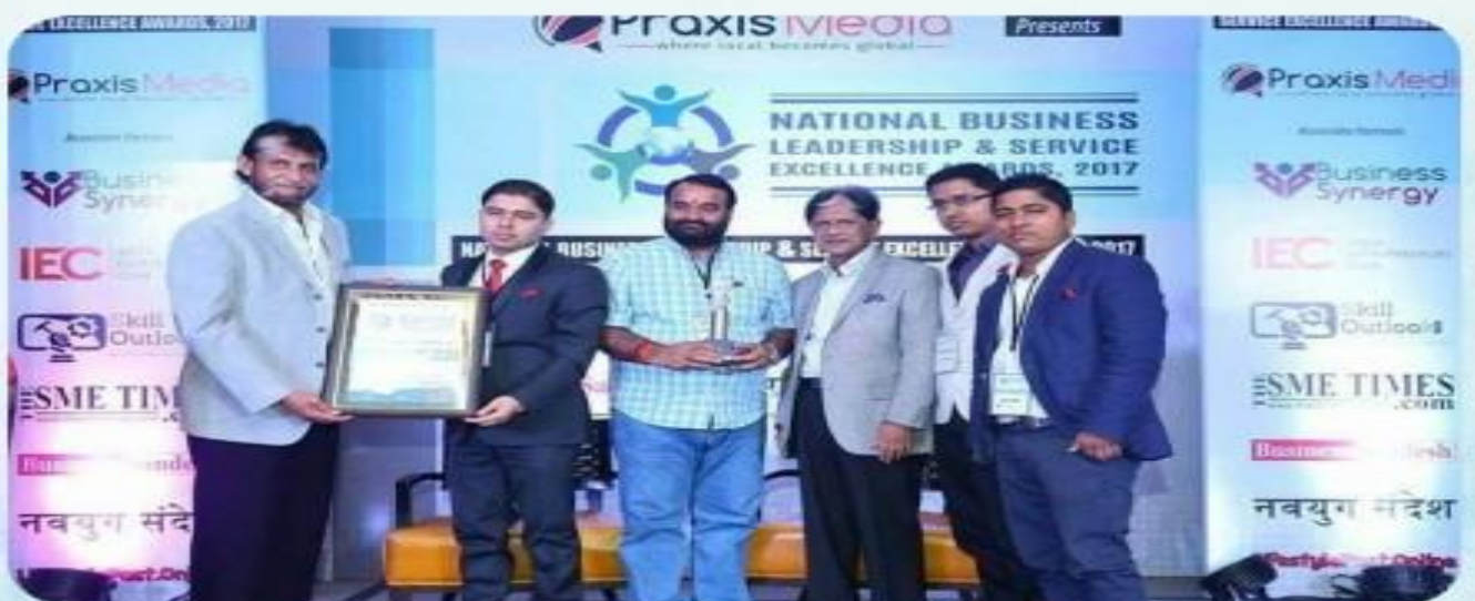
Best Vocational Training Institute in Assam at National Business Leadership & Service Excellence Award 2017