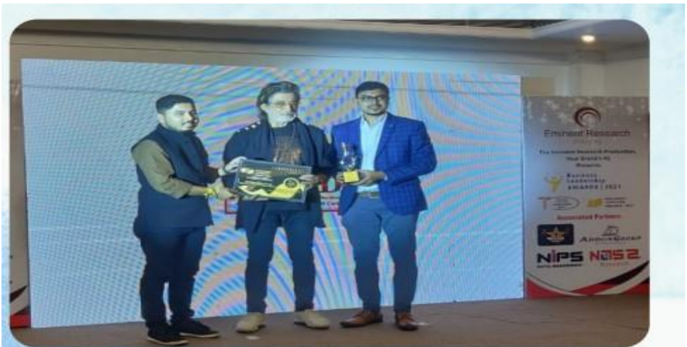
NRDS Received Education Leadership Award from Actor Shakti Kapoor in 2021 for Leading Educational Institute for the Development of Rural Areas.