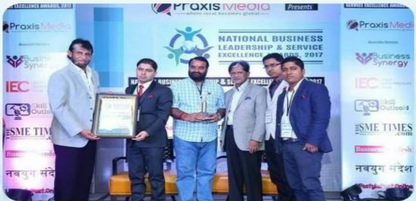
Best Vocational Training Institute in Assam at National Business Leadership & Service Excellence Award 2017